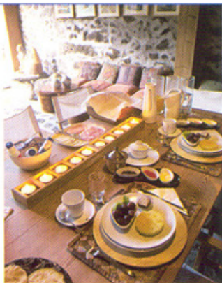
Breakfast at Pocinho Bay

Pico At Pocinho Bay, enjoy breakfast on a terrace that faces the sea. Dip in the pool or walk across the street to the natural pools in the Atlantic. The classy boutique is on a 5-mile marked footpath that runs through UNESCO vineyards, from Verdelho to Criação Velha. Rates start at 125 euros, 011-351-292-628-460, www.pocinhobay.com .